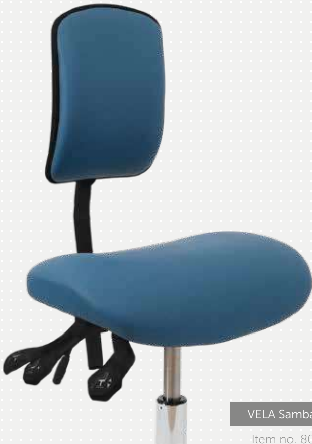
VELA Samba 150