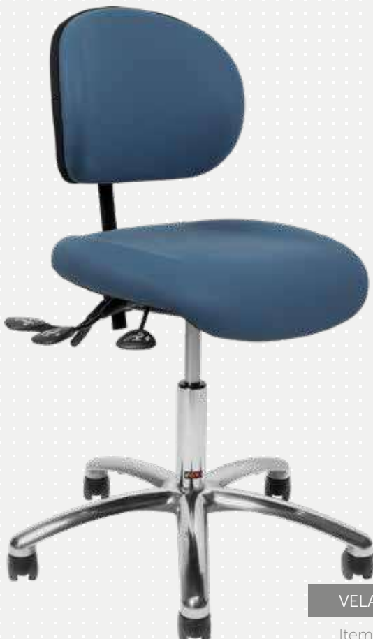
VELA Latin 100