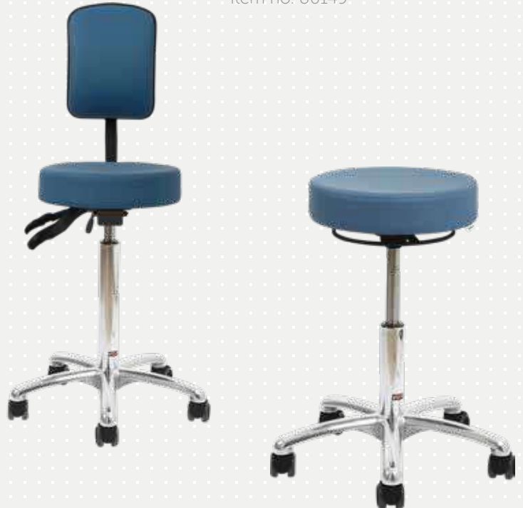
VELA Samba 500