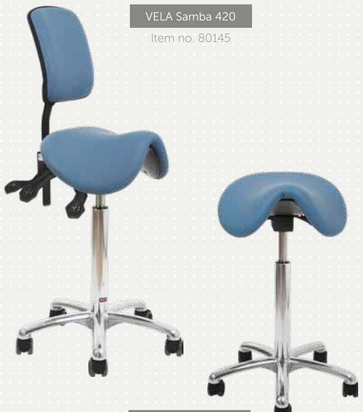
VELA Samba 420